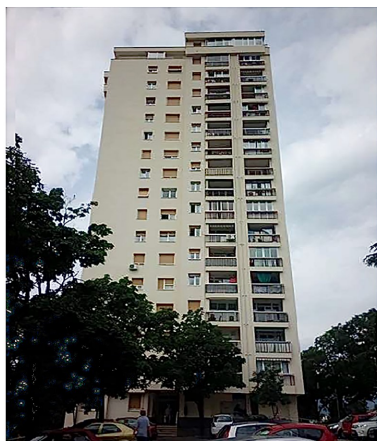
Facades of the building after energy renovation

Under the call 'Energy renovation of multi-apartment buildings', 579 contracts on the award of grants from the European Regional Development Fund have been signed to date. The amount of total investment is over one billion kuna, out of which more than 550 million kuna are grants from the European Regional Development Fund.