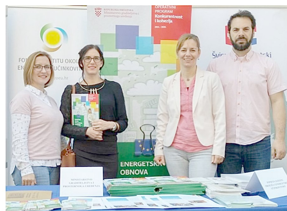
Representatives of the MCPP at Europe day

The aim of Europe Day is to raise citizens' awareness of the Union through various events that explain the way the Union operates and is organised, as well as the benefits it brings. Apart from the open doors of all European institutions, there was an informational gathering with the citizens at the European Square, where this year again numerous visitors participated in various activities.