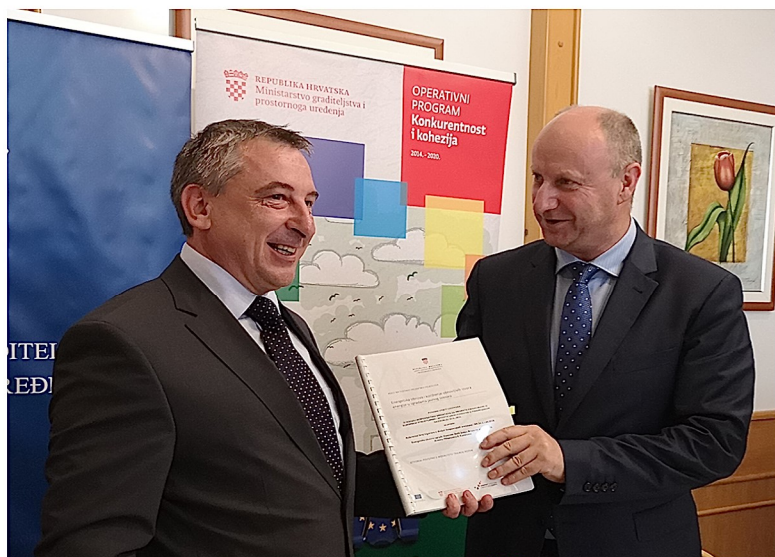
Ministar Predrag Štromar, head of IB1 hands over to the beneficiaries Contracts on the award of grants

M inister of Construction and Physical Planning Predrag Štromar signed and handed over to the beneficiaries the first Contracts on the award of grants under the Call 'Energy renovation and use of RES in public sector buildings'.