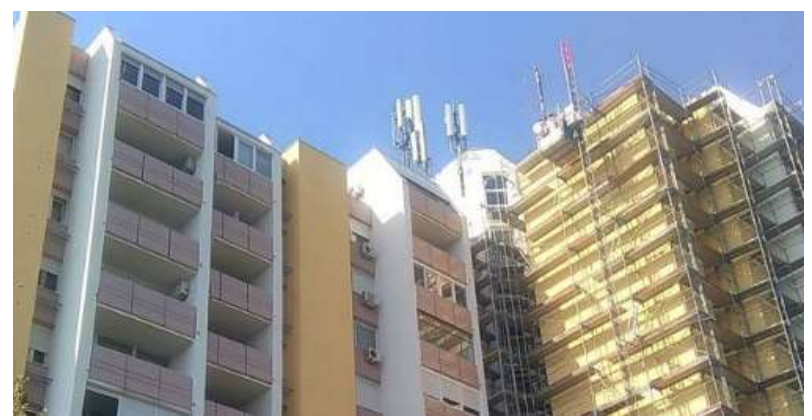
Multi-apartment building Sjenjak 101, Osijek

The multi-apartment building Sjenjak 101 in Osijek was the first building to start energy renovation co-financed with 3.398.223,96 kuna of grant from the European Regional Development Fund, and constitutes the best example of good practice under the Call "Energy renovation of multi-apartment buildings". It is the biggest and highest building with most residents in the respective settlement, meaning that data on the realisation of this energy renovation project is impressive as well, with the residents' initial investments to be paid out soon through savings.