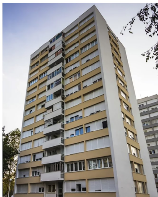
Multi-apartment building after energy renovation