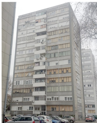
Multi-apartment building before energy renovation

In the City of Zagreb, a total of 78 multi-apartment buildings will be renovated, for which the total amount of energy renovation investment exceeds HRK 194 million, out of which grants from the the European Fund for Regional Development exceed HRK 107 million.