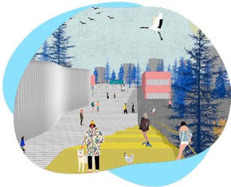
The Fantastic Forest Phenomenon, Croatia