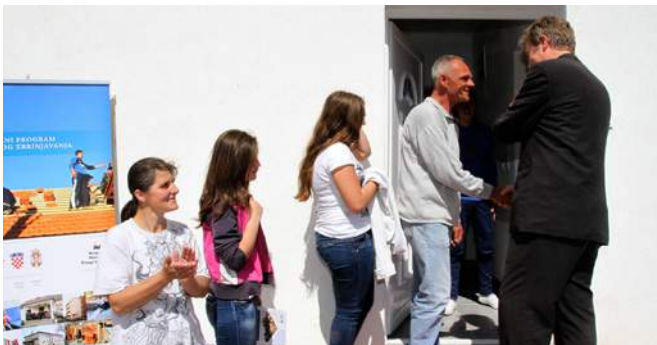
Beneficiary family in Olovo, Bosnia and Herzegovina

The four Partner Countries will continue to push on with construction works through this summer and autumn, with over 1 800 beneficiary families selected and numerous tenders launched and / or completed. Within the first five months of 2016, RHP implementation accelerated considerably and present activities are set to create new homes for thousands of vulnerable people. At the current pace, the number of housing units delivered this year is expected to be triple that of 2015.