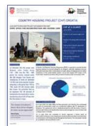
Croatia View PDF