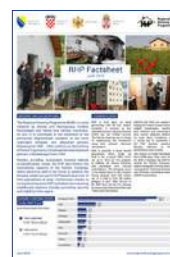
RHP Regional Factsheet View PDF