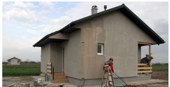
Pre-fab house in Simanovci, Serbia

In Croatia , after the successful completion of the project in Korenica, three more construction sites are now active in Glina (reconstruction of a home for 75 elderly and disabled persons), Knin (construction of two residential buildings with 40 apartments) and Benkovac (construction of an apartment building for 21 families). Furthermore, Croatia has already purchased 58 apartments under the project HR4, targeting the purchase of flats for 101 beneficiary households. As of today, 87 housing units have been provided to beneficiaries in Croatia, and another 50 are expected to be completed by the end of the year.