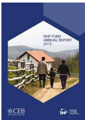
RHP Fund Annual Report 2015 View PDF

In May and June 2016, several publications were issued: