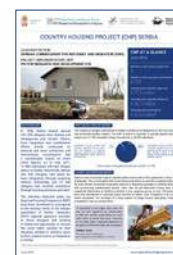
Serbia View PDF