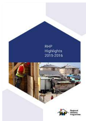
RHP Highlights 2015 - 2016 View PDF