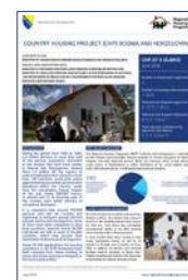
Bosnia and Herzegovina View PDF