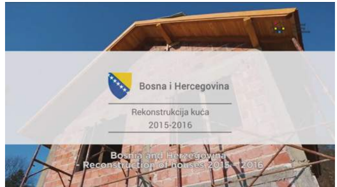
Bosnia and Herzegovina: short film on re-construction of houses 2015 - 2016