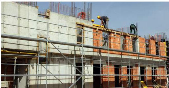
Progress of works in Glina, Croatia

Montenegro is moving forward with RHP construction projects in three main towns – Niksic, Konik and Pljevlja. In Niksic, the construction of two apartment buildings to accommodate 62 vulnerable families was finished in May and the flats were handed over in June. The construction of 120 apartments in Konik Camp was launched in March 2016, with an estimated completion date within the 2nd half of 2017, while the inauguration of the construction site in Pljevlja was officially marked at the end of June.