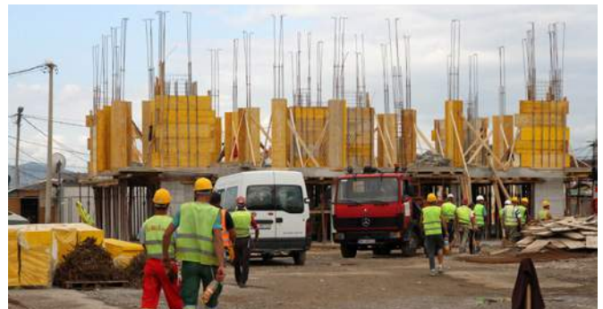
Progress of works in Konik Camp, Montenegro

Beneficiary selection in Bosnia and Herzegovina is well advanced for all sub-projects, as is the delivery of building material packages and reconstruction of houses. Twenty housing units have already been provided and close to 1 000 beneficiaries are expected to move into their new houses by late 2016. The latest RHP Steering Committee meeting in Sarajevo also presented RHP Donors and other stakeholders with an opportunity to visit some RHP beneficiaries in Novo Gorazde.