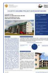
Montenegro View PDF